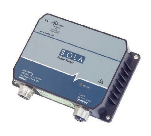
IP67 SCP-X SELF-SEALED POWER SUPPLY 5.4" x 7" x 1.8"