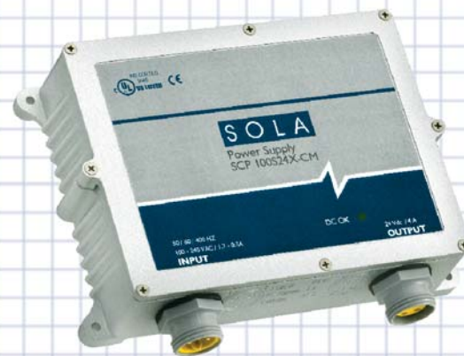
SCP-X self-sealed power supply: