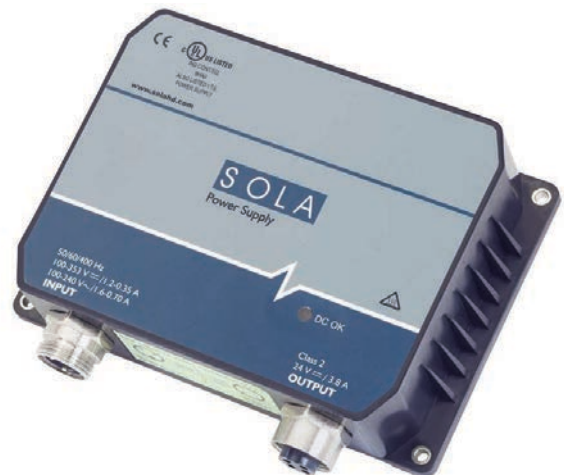
IP67 SCP-X SELF-SEALED POWER SUPPLY 5.4" x 7" x 1.8"