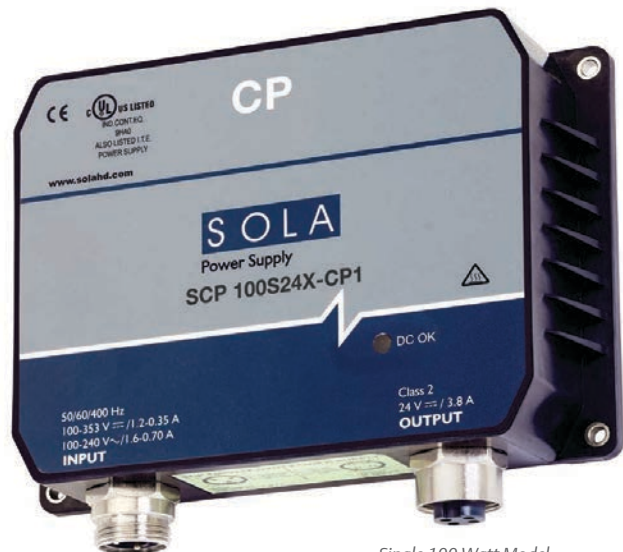
Single 100 Watt Model