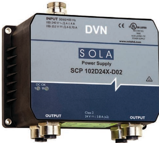
Dual 100 Watt Model